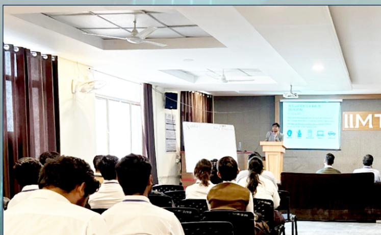
Some Glimpses of the event