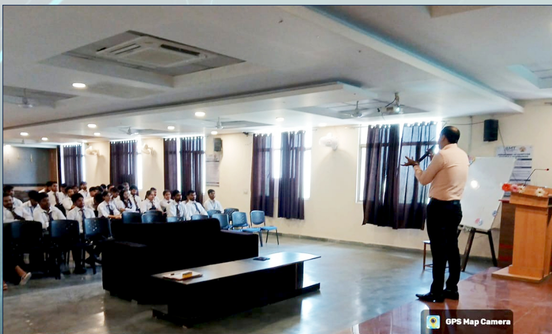
Some Glimpses of the event