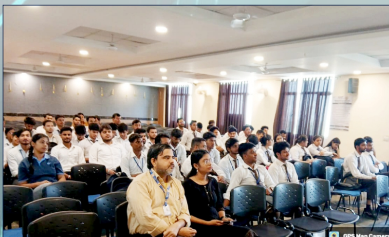
Some Glimpses of the event