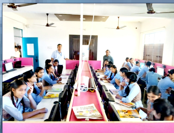
Some Glimpses of the event