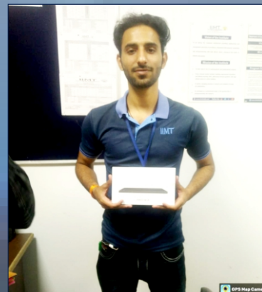
Some Glimpses of the event